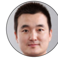
Stone Yan Beijing, China

bhupendra.bangari@dhc.co.in T: +91 22 6672 9605